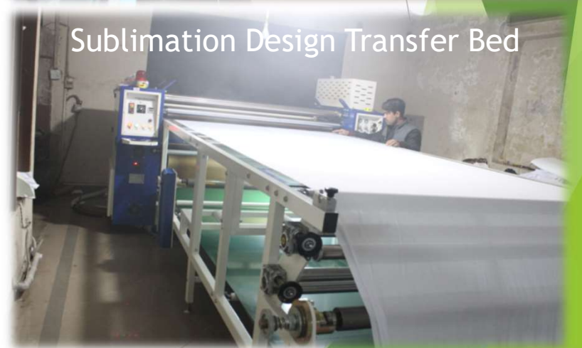
Sublimation Design Transfer Bed