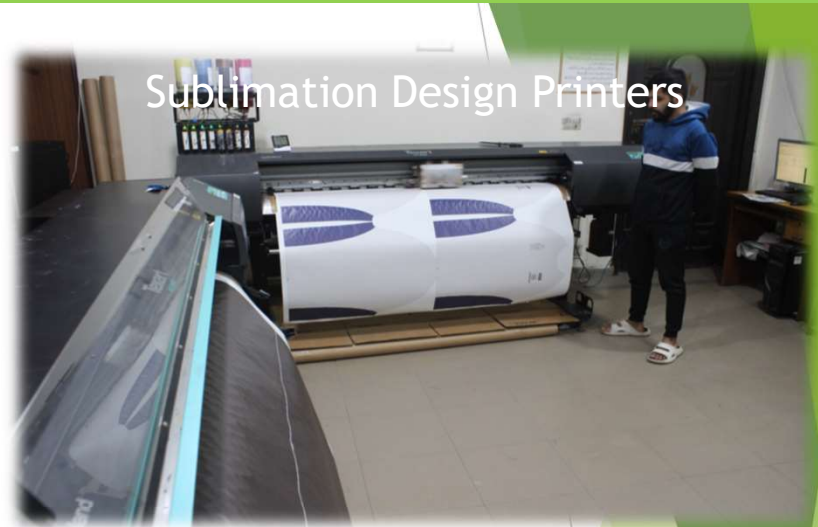
Sublimation Design Printers